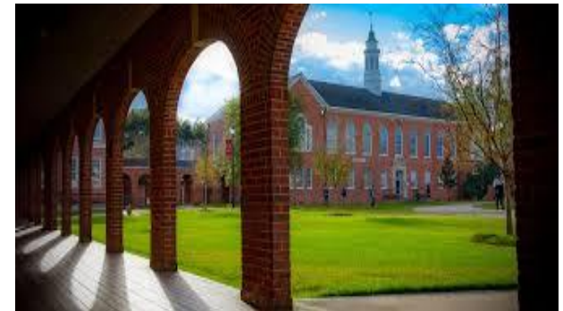
Walk of Honor, UL Lafayette

1999-2024: International Child Phonology Conference US-Europe-Canada (24)